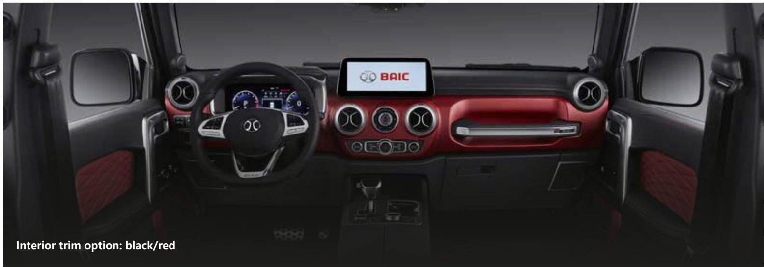
Interior trim option: black/red