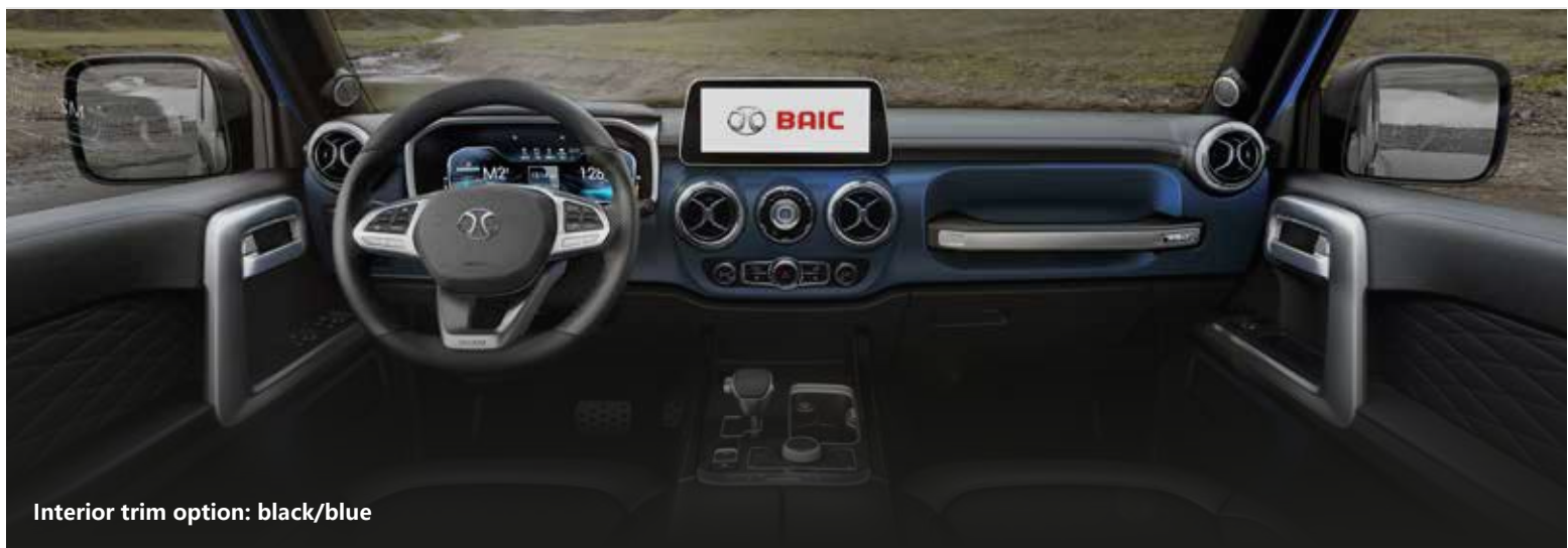
Interior trim option: black/blue