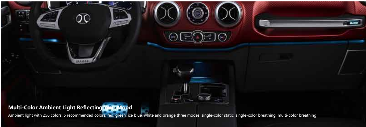
Multi-Color Ambient Light Reflecting Your Mood Ambient light with 256 colors. 5 recommended colors: red, green, ice blue, white and orange three modes: single-color static, single-color breathing, multi-color breathing